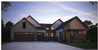
ELEVATION C - MODERN MOUNTAIN