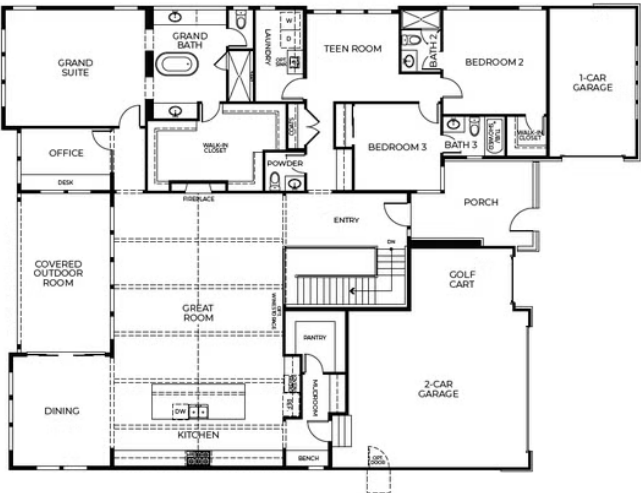
FIRST FLOOR Approx. 3,001 Sq. Ft.