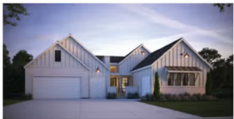
ELEVATION A - MODERN FARMHOUSE