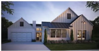
ELEVATION A - MODERN FARMHOUSE