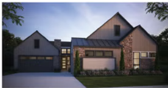
ELEVATION C - MODERN MOUNTAIN